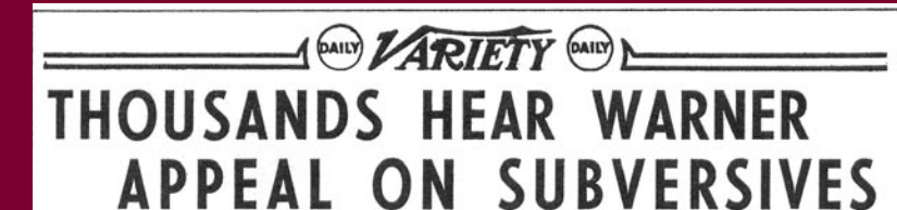
6. This Variety headline about Harry's speech was included with employee paychecks.